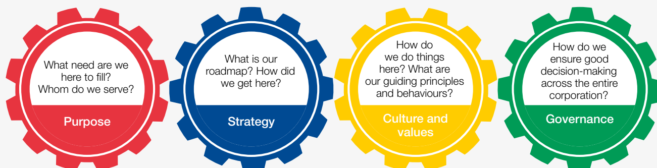
FIGURE 2 | Four critical questions the board should ask itself