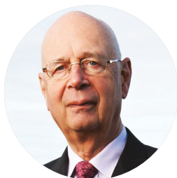
Klaus Schwab Founder and Executive Chairman, World Economic Forum

The challenges the world faces from the COVID-19 pandemic, and the underlying trends of worsening inequality and climate crisis, are presenting leaders with some of the most severe business, economic and social challenges in decades. The depth of these challenges has forced business leaders to question the most foundational aspects of how they operate: who they serve, and how they create value for these constituents. Leaders are increasingly recognizing that for a business to succeed over the long term, it must provide profitable solutions that positively affect all stakeholders. This fundamental approach to decision-making in the boardroom, through connecting value creation and stakeholder outcomes, is the heart of stakeholder capitalism.