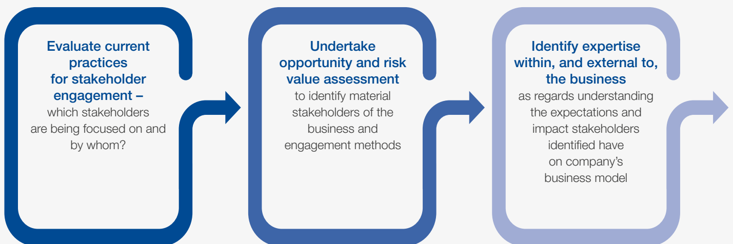
FIGURE 4 Stakeholder governance journey – recommended initial steps

Three practical initial steps are recommended for each company in advance of considering stakeholder governance improvements: